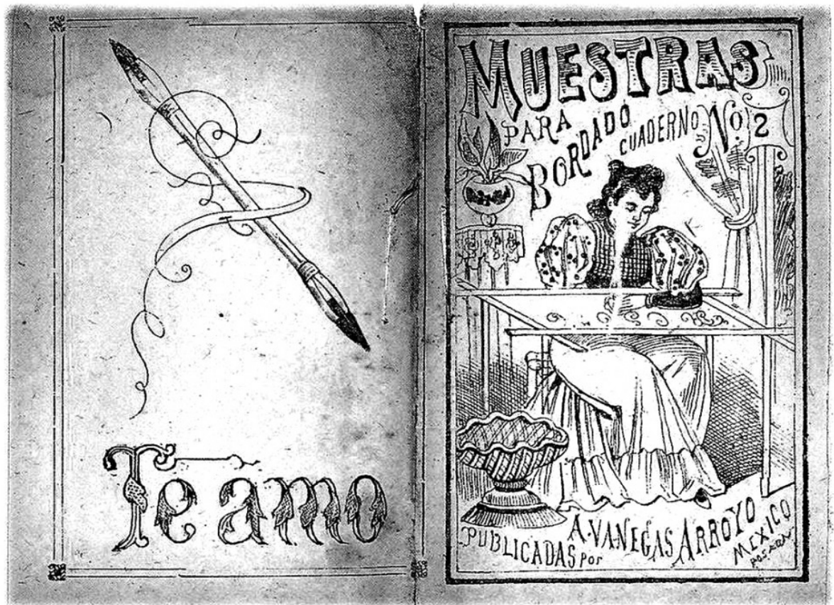
Booklet embroidery samples N° 2, by Posada while working at Vanegas Arroyo publisher.

Studying the origins of Posada iconography we found knowledge and visual education based on observation of popular facts of the time and the high culture acquired by oral and written transmission of ideas and techniques or the daily interaction with skilled colleagues. The XIX Century is the golden age of popular art. With the death of absolutist ideas of divine power of government authorities, political, social and religion thoughts were born and this allowed expression and creation liberty. Artist represented no censored artistic concepts, breaking rigid traditions established by state and clergy despotism. Posada also worked on popular concepts of the age: songbooks and corridos (popular songs from the Revolution), as well as classic children's tales.