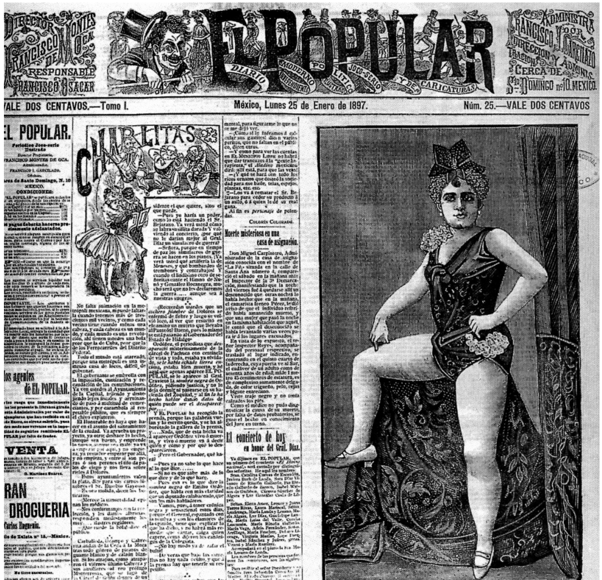
«El Popular» newspaper, January 25, 1897, Posada illustrated lot of newspapers of those years.

several newspapers: El Jicote, El Teatro, La Gaceta Callejera, El Boletín, Gil Blas Cómico, El Popular, El Amigo del Pueblo, La Patria Ilustrada, el Diablito Rojo, La Patria Festiva, Revista de México, La Risa de El Popular, Entreacto, El Chisme, La Casera, El Diablazo, La Guacamaya, San Lunes, Aladino, El Padre Padilla, Almanaque de Doña Caralampia Mondongo, El Paladín, Almanaque del Padre Cobos, La Patria, Fray Gerundio and El Fandango among others.