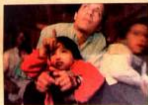
Regresó a escena cada domingo.