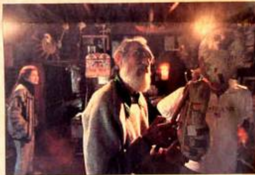
Durante el taller de creación de títeres.