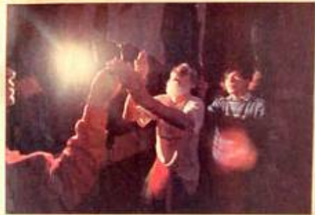
Disfrutando en el teatro y mostrando La Colibrí.