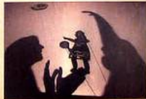
Presenta un aspecto de 'El Pueblo del Sol', última obra.