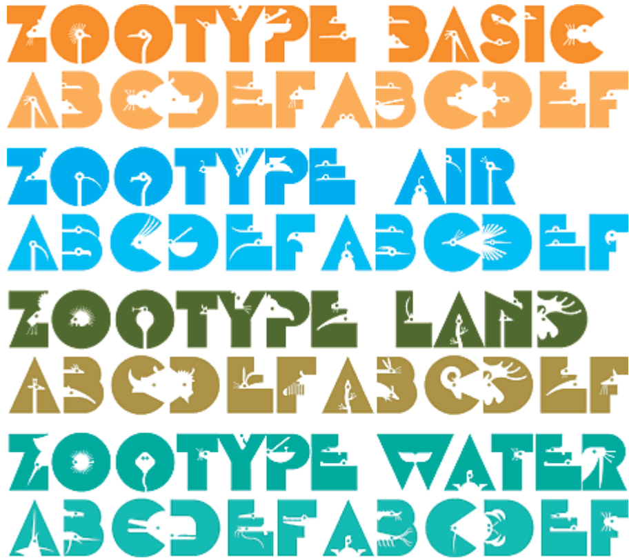
Zootype Regular , 1997; Zootype Air , Zootype Land , Zootype Water , 1999. Idea and designs: Víctor García

Later on, to start the new millennium, there were many notable and deserved awards received by regional typefaces in prestigious international competitions but that does not modify nor much less invalidates the Zootype's precedence in that exclusive club.